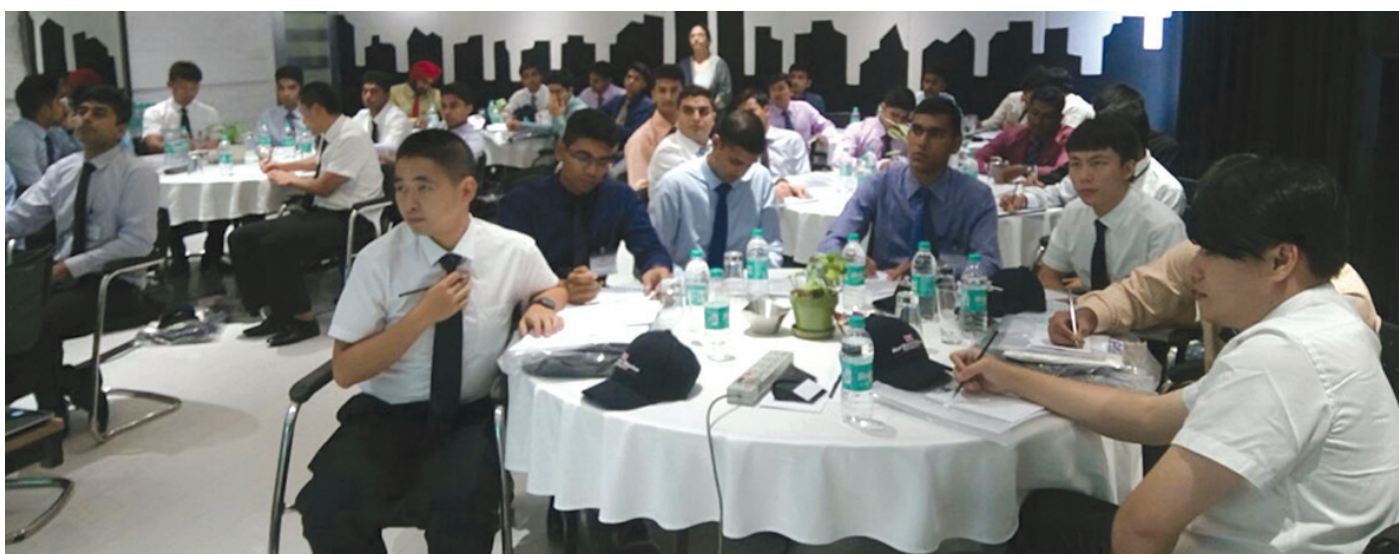
“Softskills for inducting merchant marine cadets” at Mumbai for Indian and Chinese cadets in August 2017 for