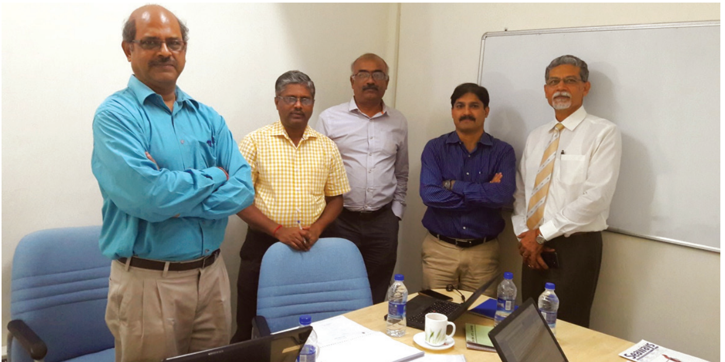
28 April 2017 – QMS audited & certified upgraded to ISO 9001:2015 Standard.