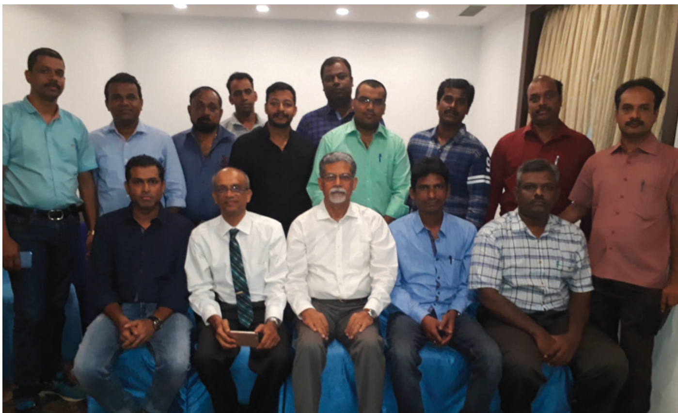
Hydraulic Breakdown management workshop for PIL – 13-14Oct 2017