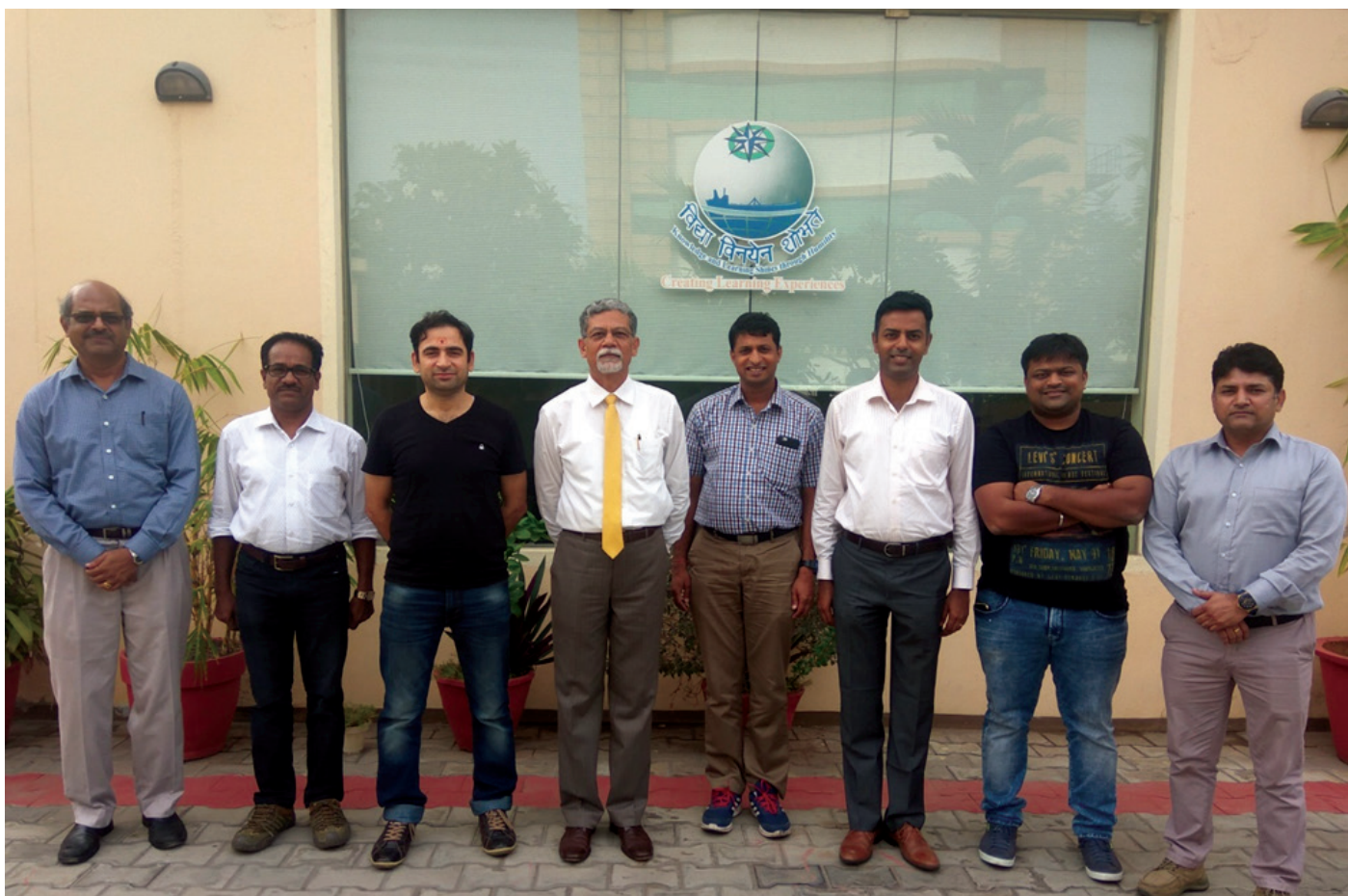
DNV-GL Internal Auditor Course for ISM/ISPS/MLC in Oct 2017 – 11th & 12th.