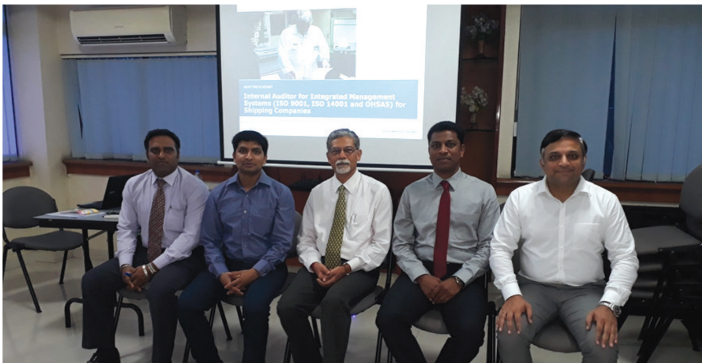
3 days Internal Auditor for ISO 9001:2015; ISO 14001:2015 & OHSAS 18001:2007 on 31 July 17 to 2 Aug 17 at Chennai for