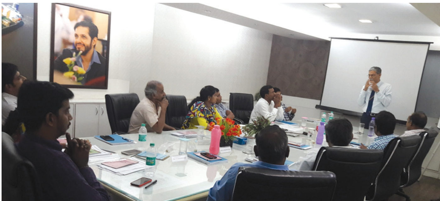
In-house Internal Auditor Course for ISM/ISPS/MLC in June 17 for Penta Crystal Ship Management, Chennai.