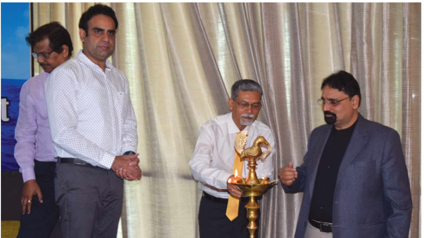
Continued relationship – invited for 'Nautical Insights' towards offerings in Gujarat Maritime University. May 2017.