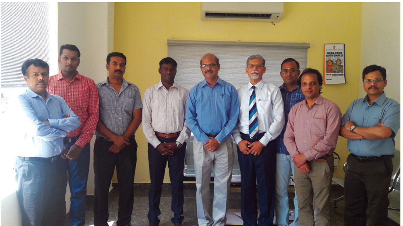
Internal Auditor Course for ISM/ISPS/MLC in May 17